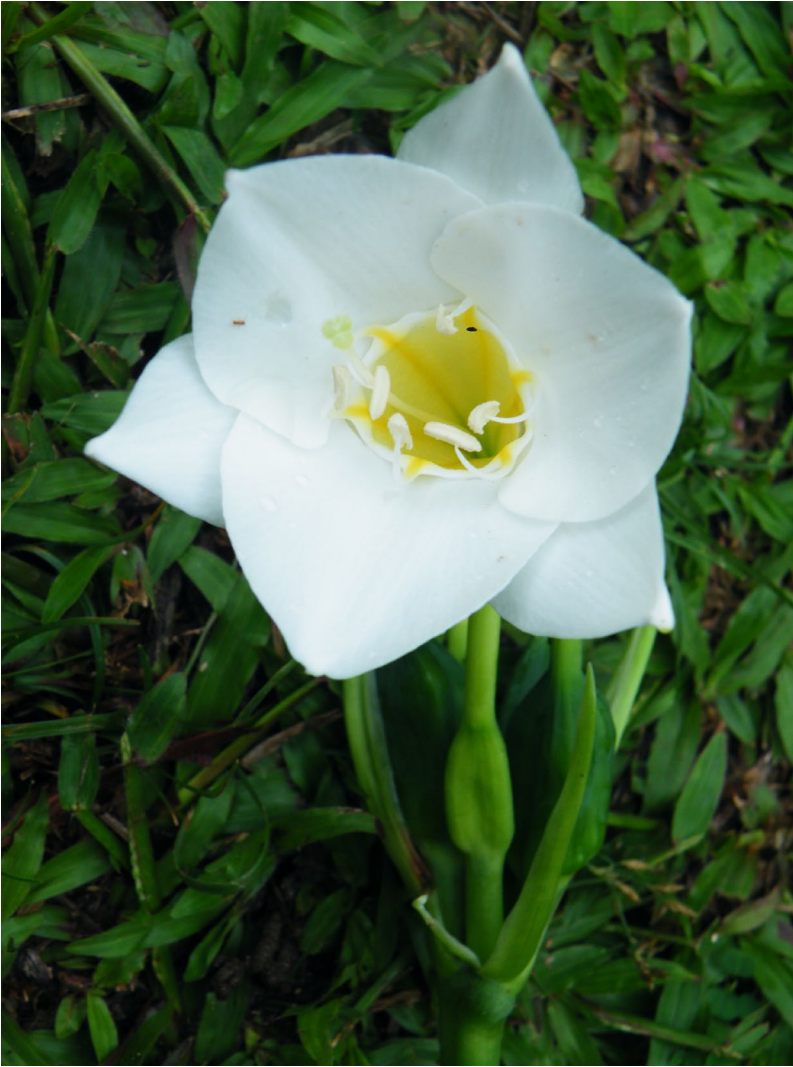
Figure 1. A specimen of Eucharis sanderi (A.P. Yusti-Muñoz 107) from Isla Gorgona, Guapi municipality, Cauca department, Colombia.

Eucharis sanderi is an uncommon species in the places where it is found, because it seems to be restricted to the vicinity of streams in the understory of tropical rainforest. The determination of its occurrence on the Pacific coast of the country has been complicated, and some records of the species were derived from anecdotal reports. Thus it is important to ascertain the conservation status of this population on the island. Isla Gorgona is a protected area that belongs to the National Parks of Colombia, and is an ideal natural laboratory to develop studies on the natural history and ecology of this and other plant species typical of the Chocó biogeographic region.